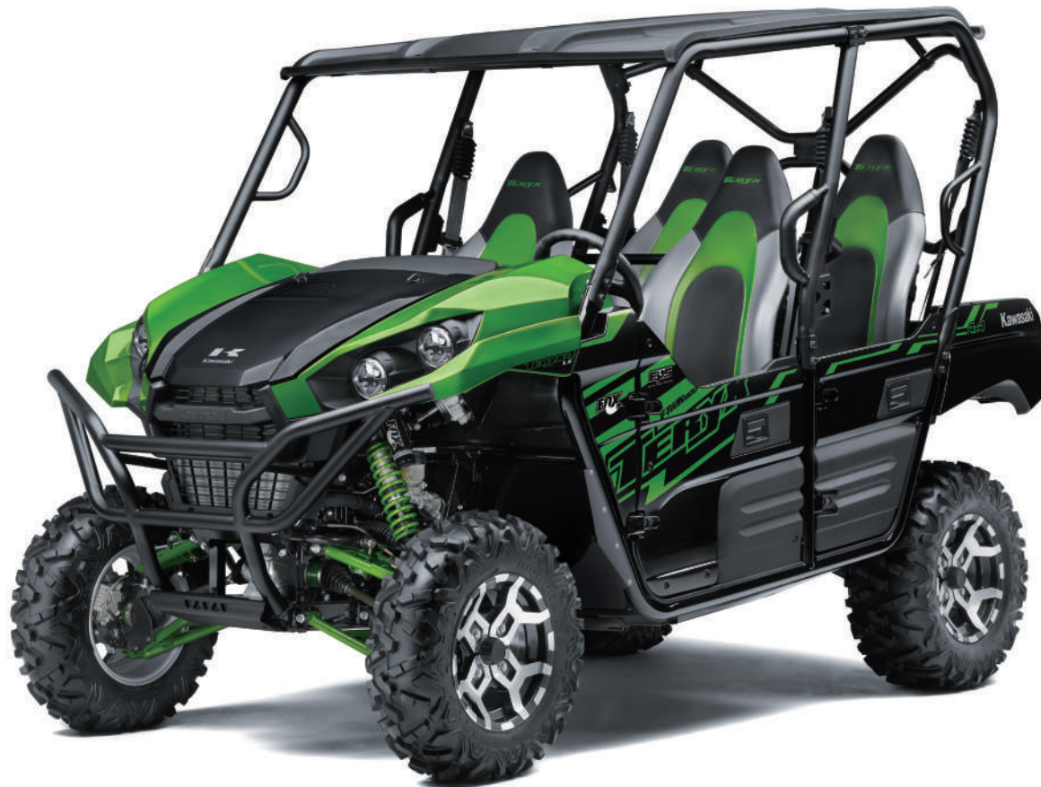
TERYX4 LE CANDY LIME GREEN