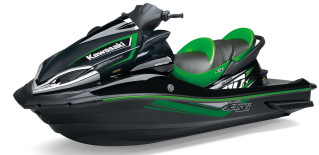
Jet Ski® Ultra® 310X