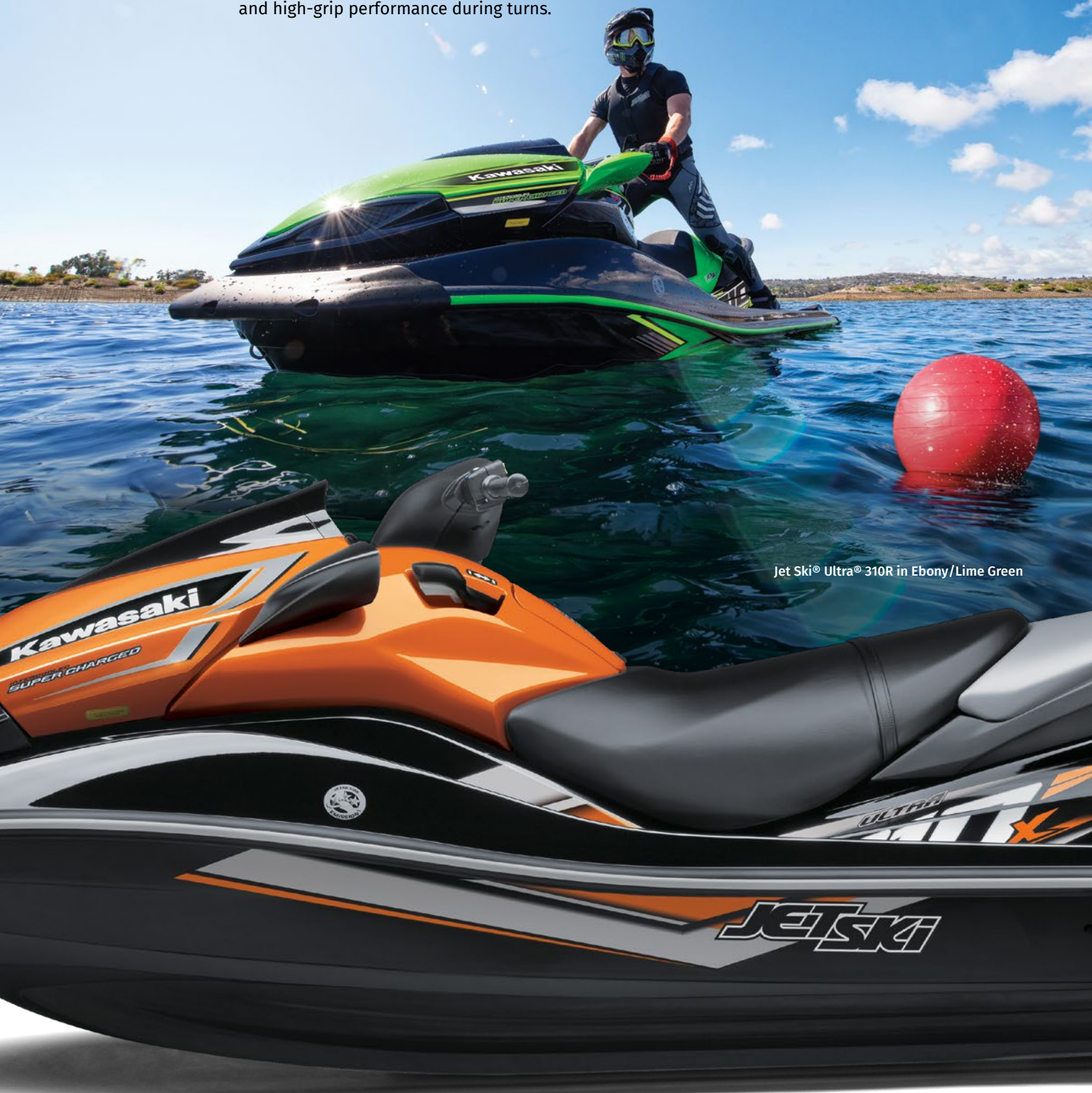
Jet Ski® Ultra® 310R in Ebony/Lime Green

Designed with Kawasaki's championship-winning race machines in mind, the 22.5-degree deep-V hull enables the watercraft to manage swells and waves with extreme efficiency and less shock. Tuned sponsons increase straight-line stability and high-grip performance during turns.