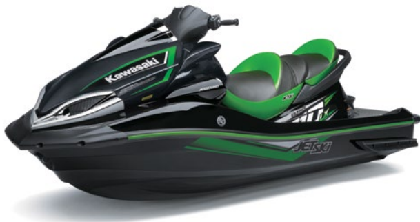
■ Metallic Carbon Gray