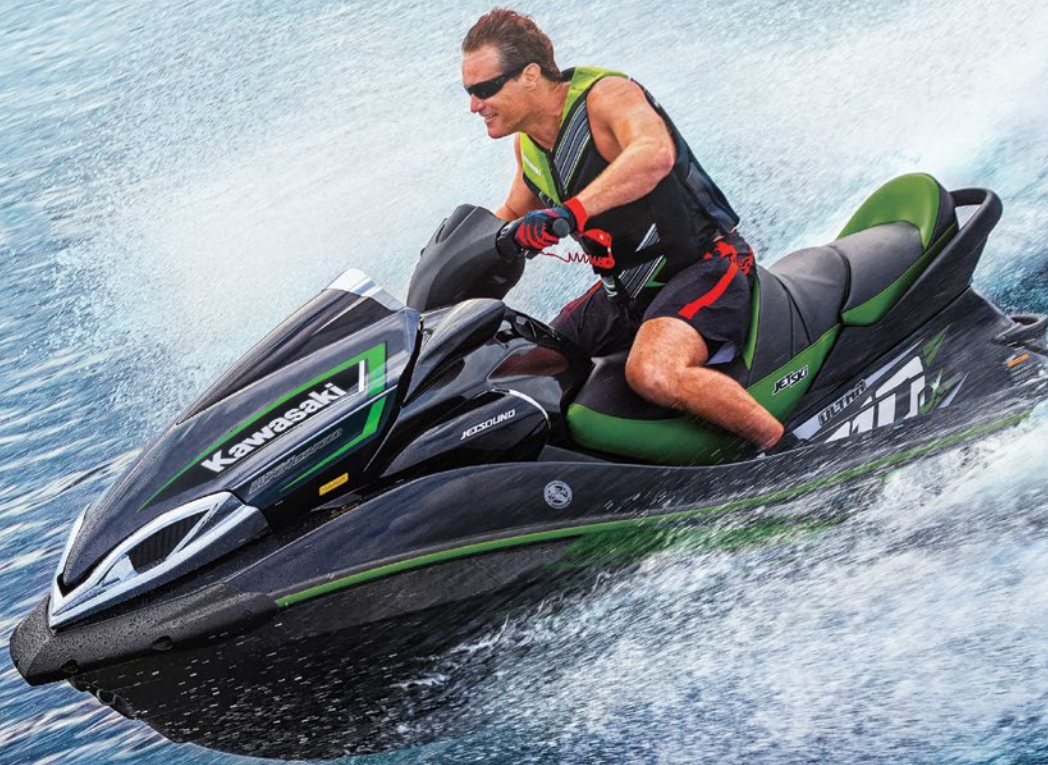
Jet Ski® Ultra® 310LX in Metallic Carbon Gray

Luxury gets a boost with the supercharged Jet Ski® Ultra® 310LX personal watercraft. The JETSOUND® audio system, industry-exclusive heat-resistant LXury seat and GPS mount let you explore uncharted waters in unparalleled comfort.