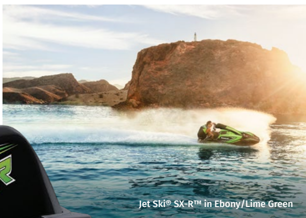
Jet Ski® SX-R™ in Ebony/Lime Green