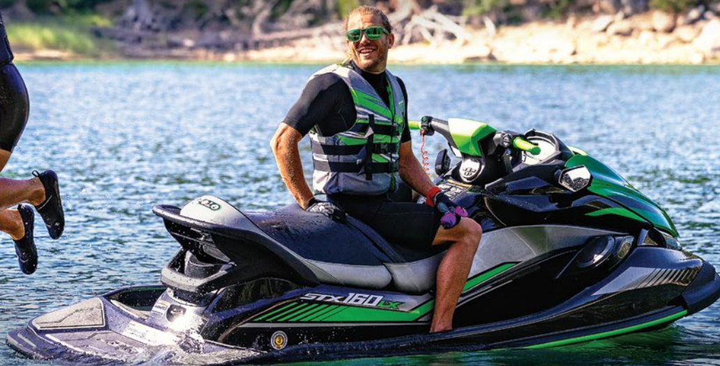
Jet Ski® STX®160LX in Ebony/Candy Lime Green