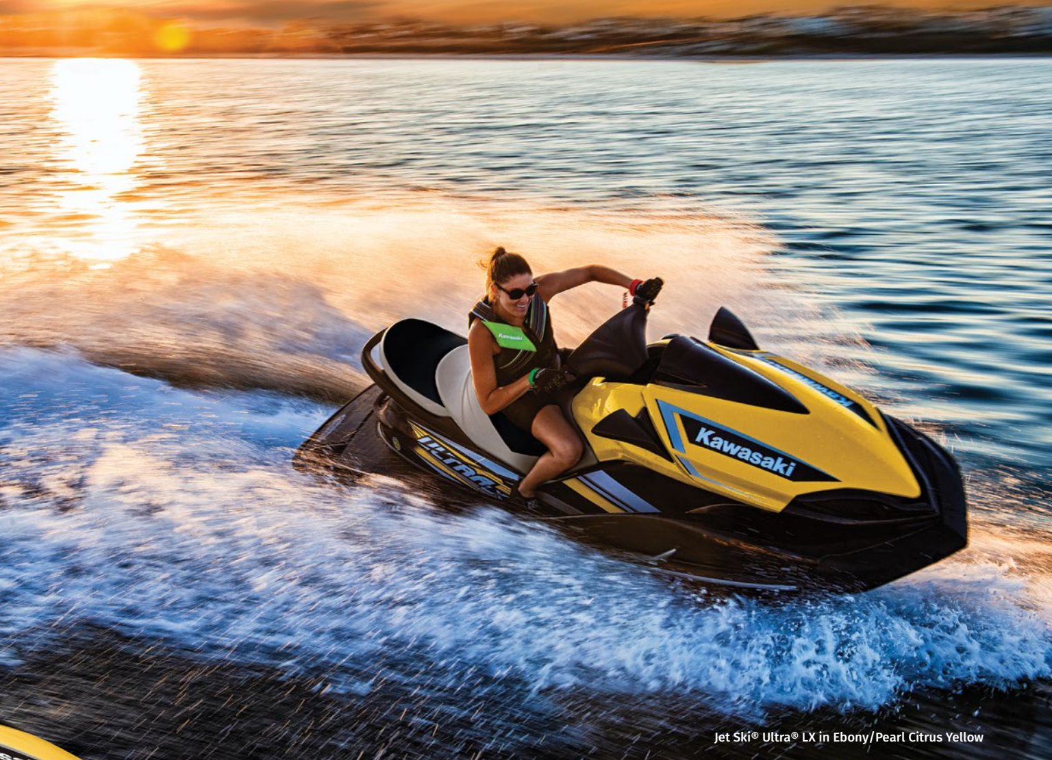
Jet Ski® Ultra® LX in Ebony/Pearl Citrus Yellow

The four-stroke, naturally-aspirated 1,498cc engine of the Jet Ski® Ultra® LX personal watercraft produces abundant power with strong acceleration. Take your aquatic adventures the distance thanks to the 20.6-gallon fuel capacity.