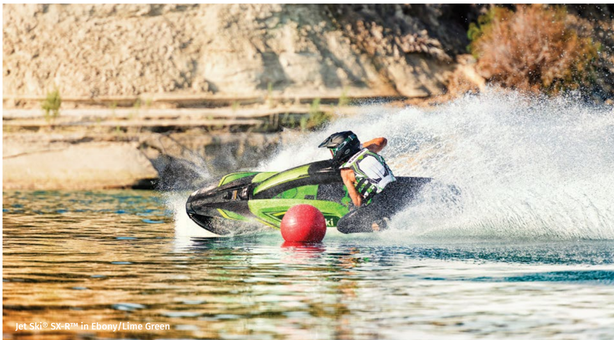
Jet Ski® SX-R™ in Ebony/Lime Green

The V-shape hull design delivers light handling and agility for ultimate exhilaration. The hull lowers and centralizes the engine for maximum cornering performance, handling and balance.