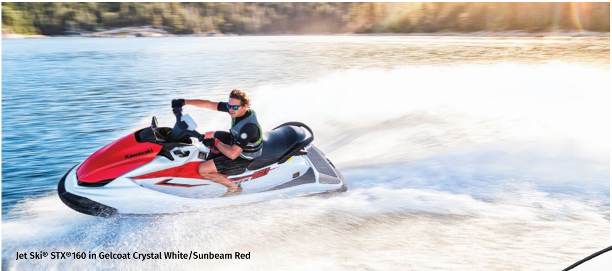
Jet Ski® STX®160 in Gelcoat Crystal White/Sunbeam Red