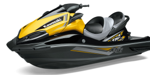
Jet Ski® SX-R™