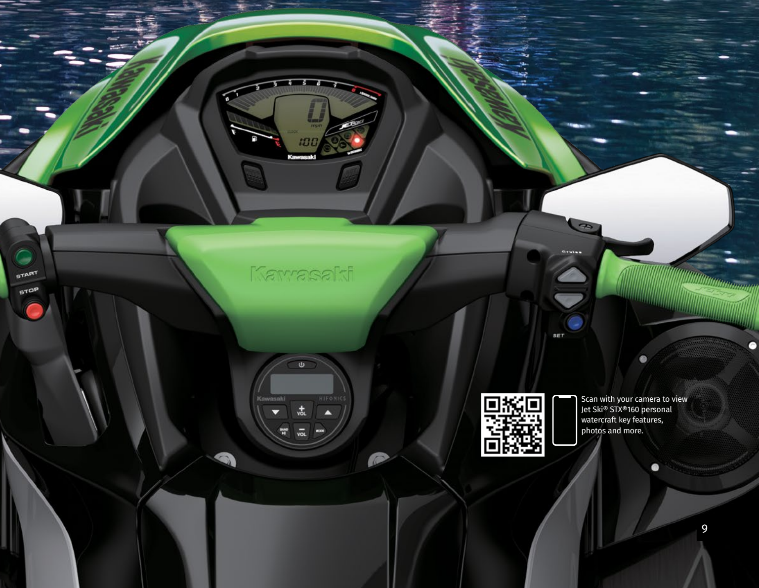
Jet Ski® STX®160 in Gelcoat Crystal White/Sunbeam Red