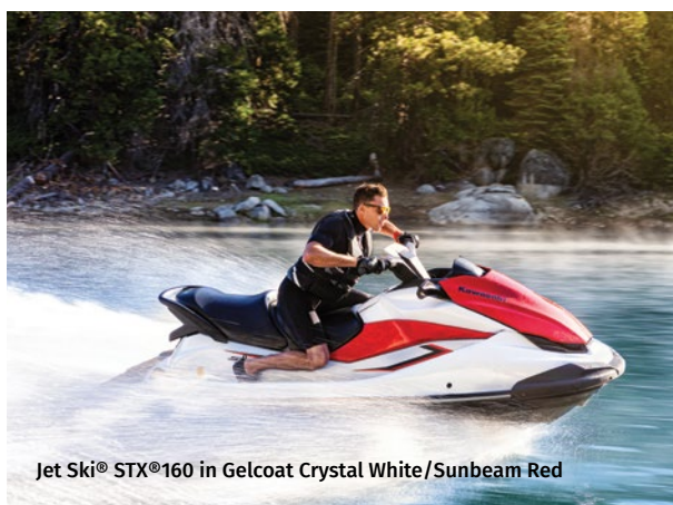
Jet Ski® STX®160 in Gelcoat Crystal White/Sunbeam Red