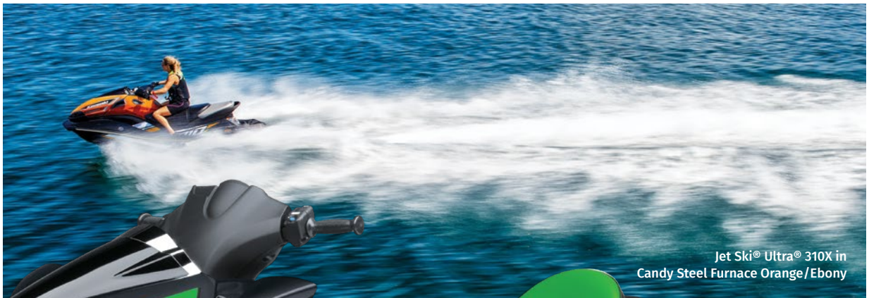
Jet Ski® Ultra® 310X in Candy Steel Furnace Orange/Ebony