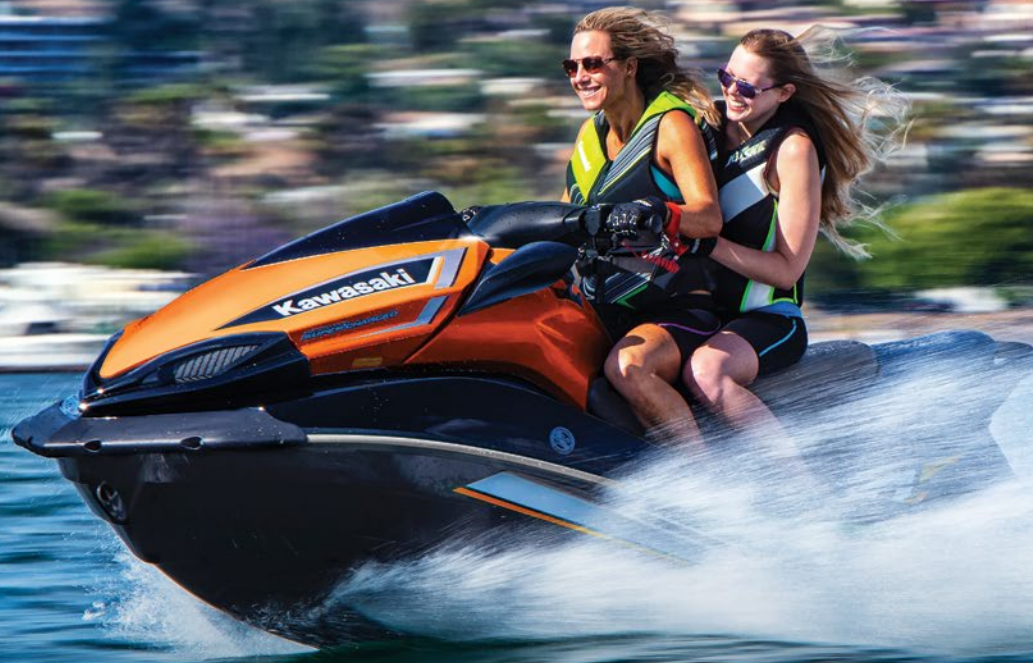
Jet Ski® Ultra® 310X in Candy Steel Furnace Orange/Ebony

Power meets innovation. Not only is the Jet Ski® Ultra® 310X the most powerful production personal watercraft in the world, it's also one of the most advanced. Take on the day with confidence. Kawasaki Smart Steering® assists with handling when the throttle is released at high speeds. A deep-V hull provides class-leading performance in a variety of conditions.