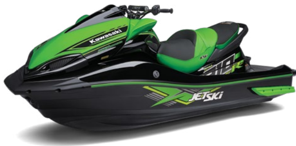
■ Ebony/Lime Green