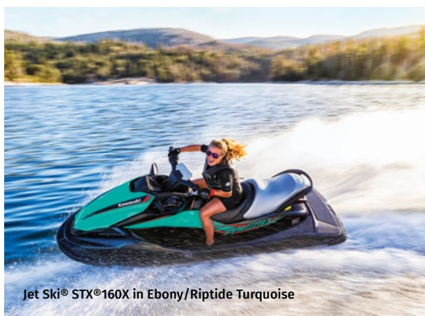
Jet Ski® STX®160X in Ebony/Riptide Turquoise