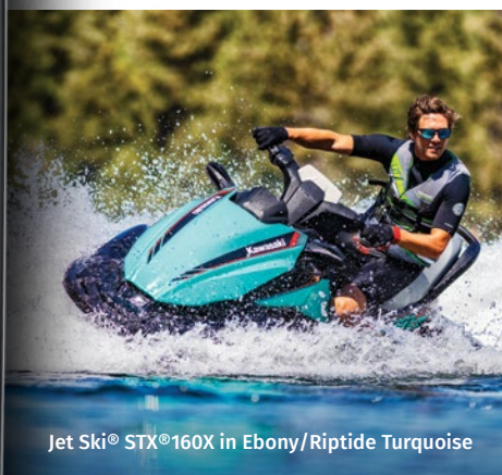
Jet Ski® STX®160X in Ebony/Riptide Turquoise