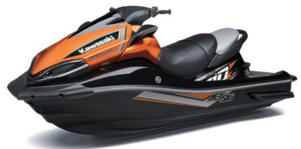
■ Candy Steel Furnace Orange/Ebony