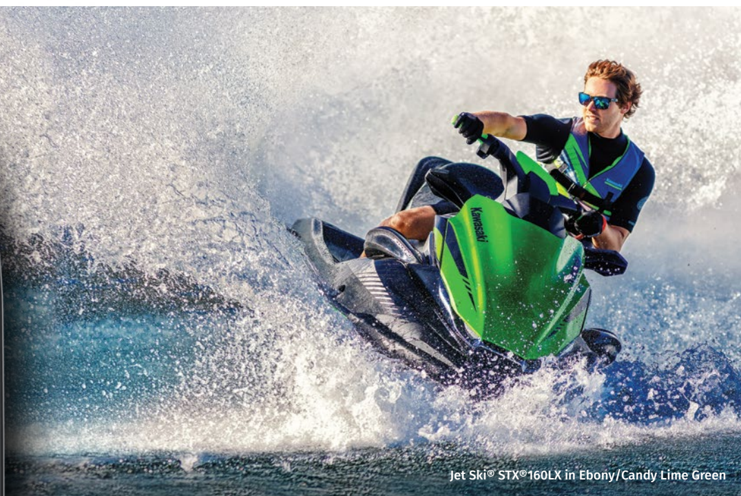
Jet Ski® STX®160LX in Ebony/Candy Lime Green