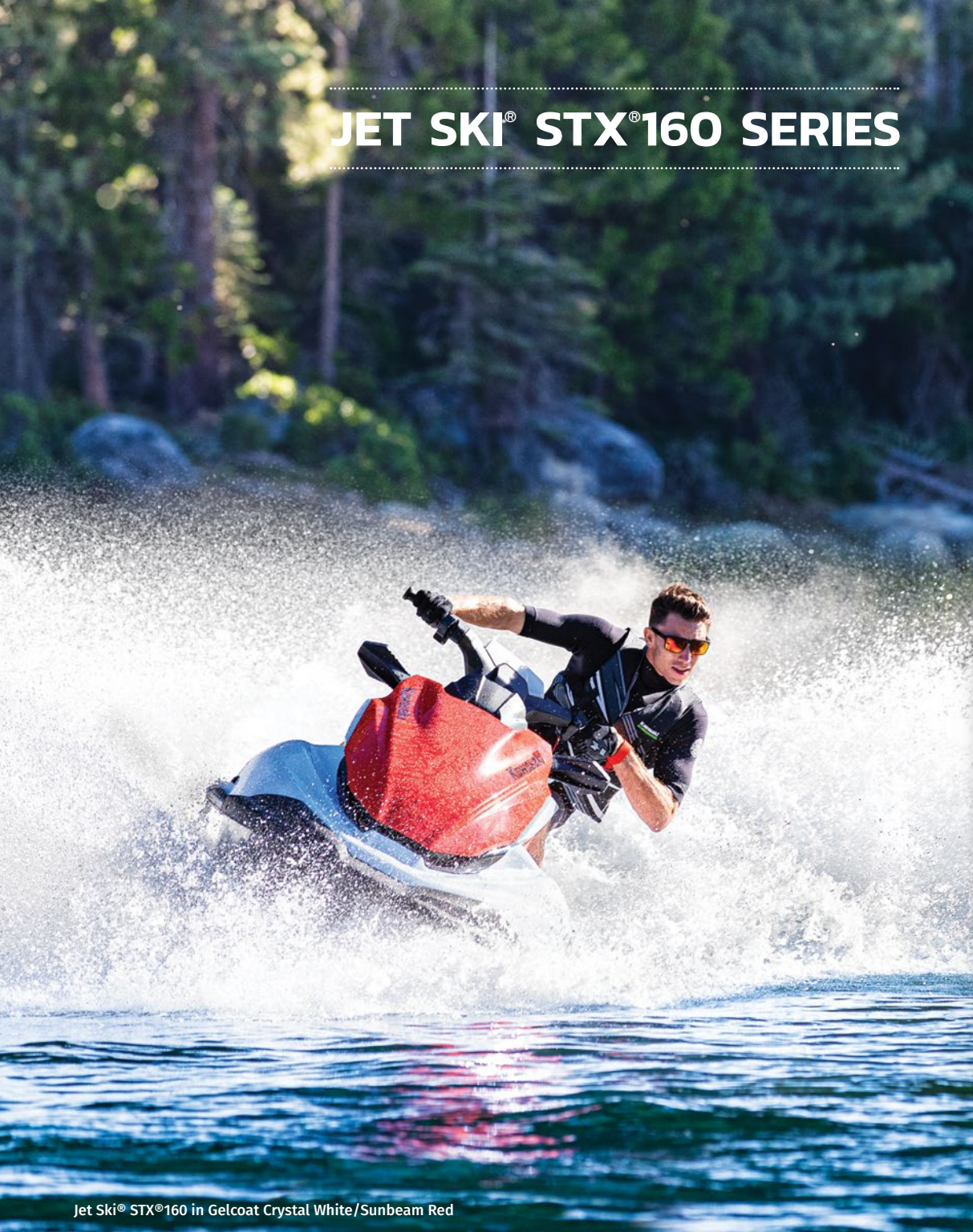
Jet Ski® STX®160 in Gelcoat Crystal White/Sunbeam Red