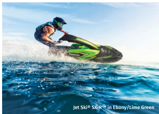
Jet Ski® SX-R™ in Ebony/Lime Green