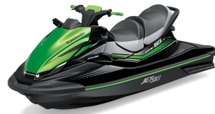
Jet Ski® STX®160